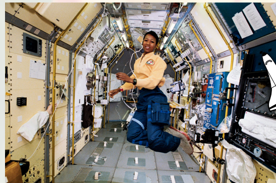
Mae Jemison, pictured here aboard the space shuttle Endeavour in 1992, was the first female African American astronaut.